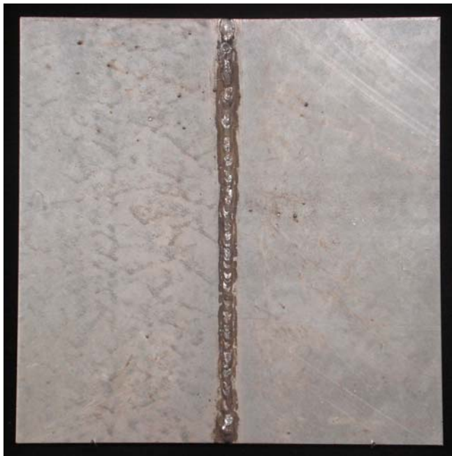
Figure 3 Showing a representative test piece after MIG welding.

In this experiment, 11 gauge panels of G90 specified hot-dip galvanized steel (ASTM A 526) were obtained from Ledford Steel Company, Winchester, KY and employed as the substrate. Two panels of the substrate were MIG-welded together to create the test area. Figure 3 shows the test piece after welding. The welded area was then Power Tool Cleaned (SSPC-SP 11). The surrounding area was Hand Tool Cleaned (SSPC-SP 2). The surface of the whole test piece was then Solvent Cleaned (SSPC-SP 1) using MEK. Figure 4 illustrates the test piece after cleaning.